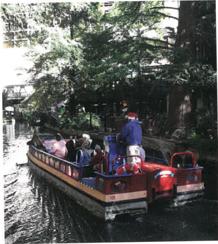
5 Days • 5 Meals: 3 Breakfasts, 2 Dinners

HIGHLIGHTS... Mission San José, The Alamo, El Mercado, Fredericksburg, National Museum of the Pacific War, Choice on Tour, Historic Pearl District, Paseo del Rio Cruise